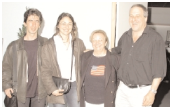
The "Dream Team" took the Bronze medals