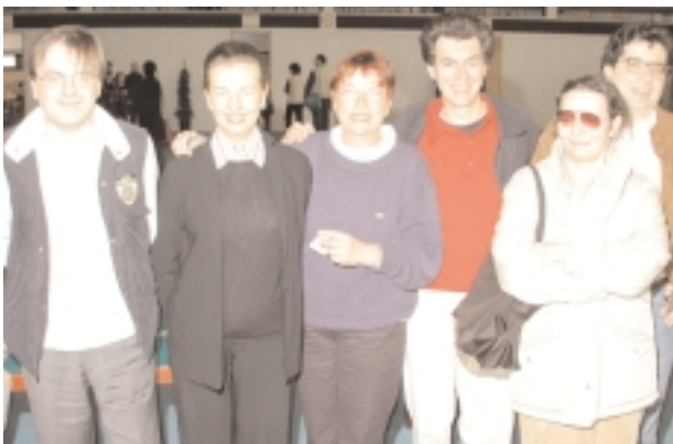
All smiles from the newly crowned Champions