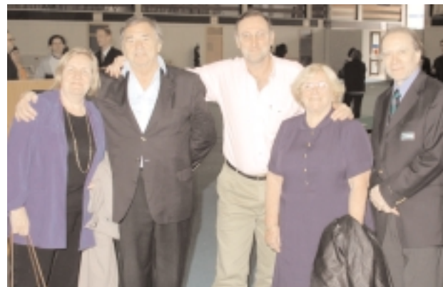
The Silver Medals go to France