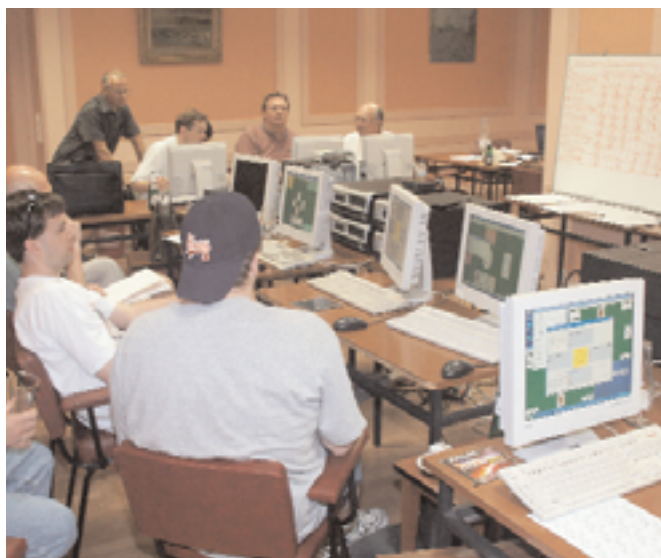
Competitors in the Computer Bridge Championship