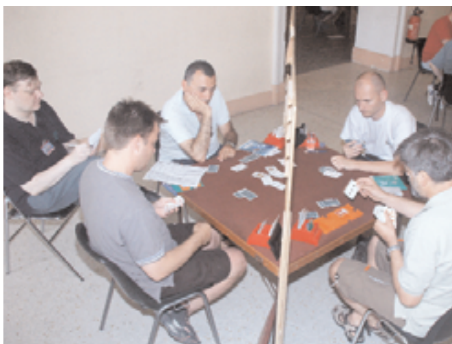
The 100.000th deal (see page 5)

Yesterday the players completed the semi-finals in the Open, Women's and Senior Pairs Championships. Today they start the two-day finals and every event will use Barometer scoring, which adds greatly to the excitement for both players and spectators. It should prove to be an interesting experience for many of our visitors, as this form of scoring is virtually unknown in, for example, North America. The VuGraph will be in operation for every session with bilingual commentary in French & English. All the finals will take place in the Palais.