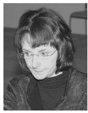
"This stuff is hard!"

If both you and your partner agree on the nature of all these passes and all doubles in both direct and reopening position you're sure to be ahead of nearly everyone else. If you're not on the same page you have hours of productive discussion awaiting you. Enjoy.