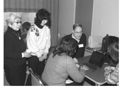
Thursday's test of LTPB project