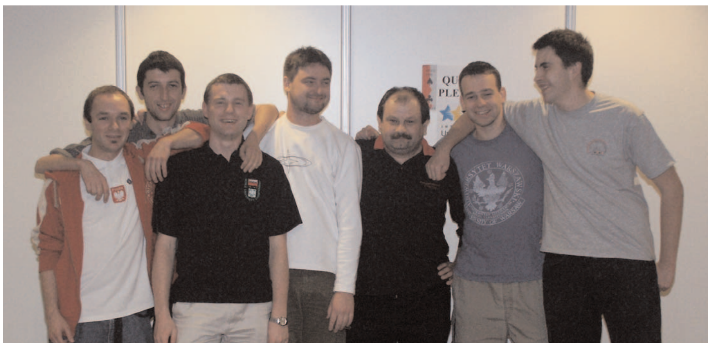
The winners: Poland

After a very exciting last round, Poland was the strongest team and becomes the new University Champion of the second FISU World University Bridge Championships!