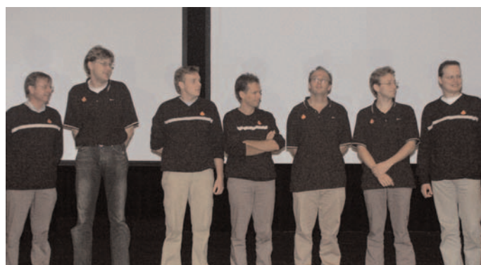
The Netherlands were second in the Olympiad

Four of the players who won the Open series of the World Bridge Olympiad for Italy have repeated as champions of the event with two new teammates. The Italians vanquished a young team from the Netherlands 310-251 to earn the title.