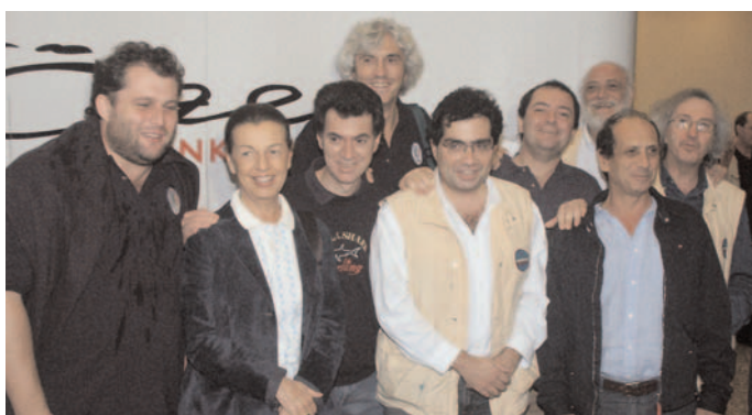
Italy: winners of the World Bridge Olympiad