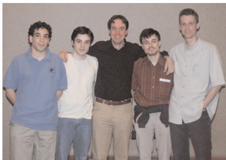
Silver medalists: Belgium