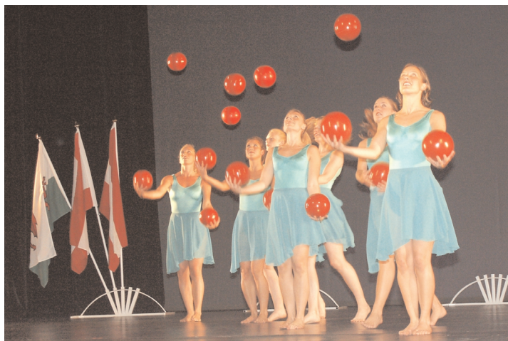
The sensational skills of the girls of the Malmöflickorna