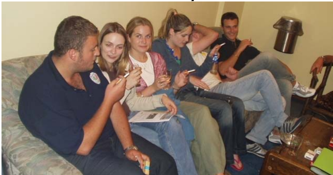
Tessa, Tallulah, Killer The Italians are enjoying an Irish Pub you can smoke in!