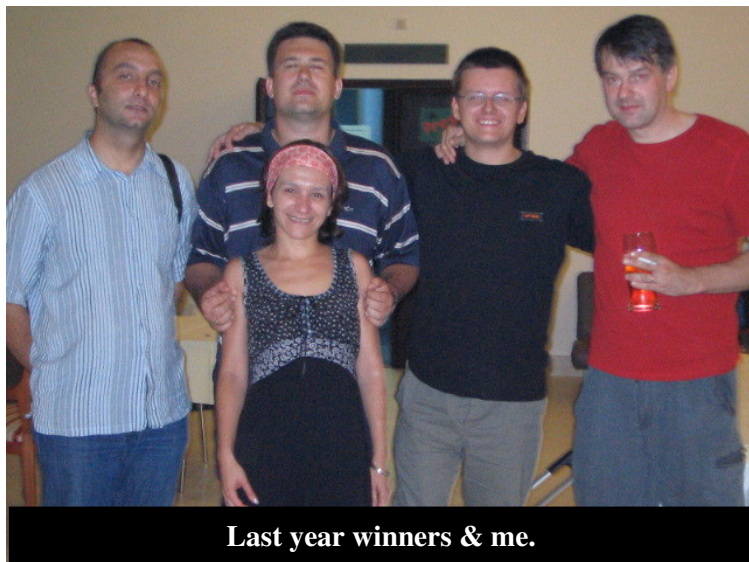
Last year winners & me.

It is not very immodest to predict more then 100 teams. Any other predictions about winners or favorites are impossible with such number of excellent players. We can only ask you for your help and assistance. Please register on time. If you need an assistance to find your perfect wining team just come to the enrollment desk and we shall try to help you, but please come on time. I know that I am repeating myself but it is really essential for being at least less late then yesterday.