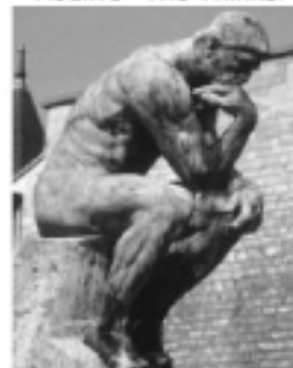
Rodin's "The Thinker"