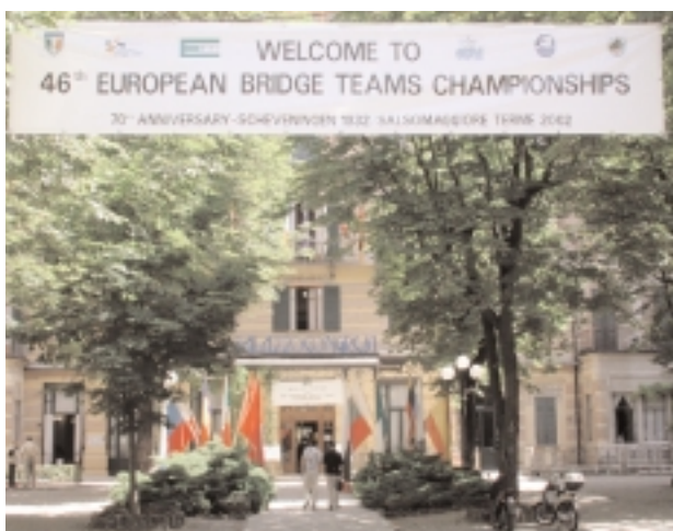
The road to Bali starts here