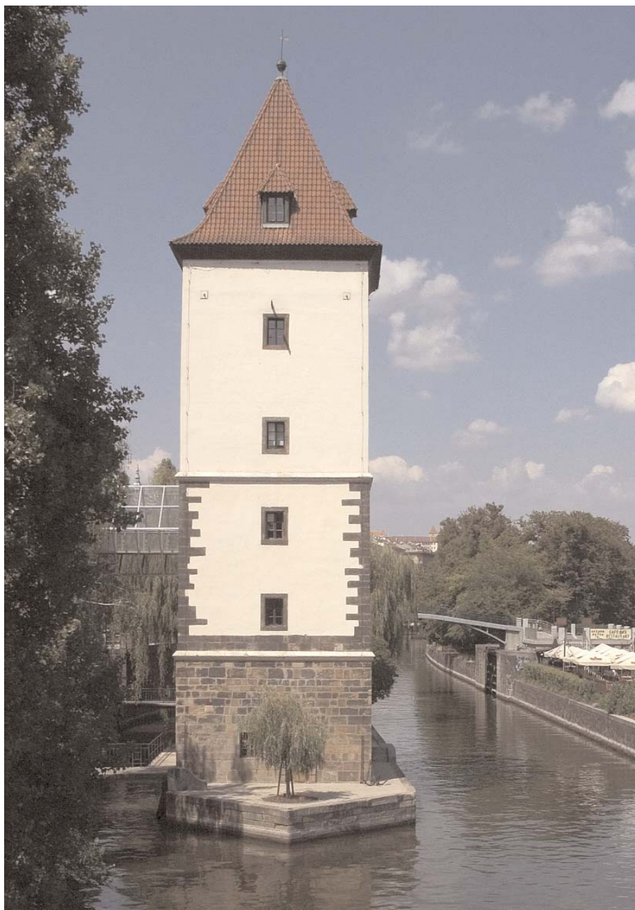
I Hope You Like The Beautiful Architecture of Prague

In the Juniors, the two leaders, Poland and Hungary both won yesterday's match to extend their lead at the top of the rankings. Poland are just 3 VPs ahead of Hungary, but then there is a massive gap of 30.5 VPs to third-placed Israel. Next in line come Norway, France, Netherlands and Italy.