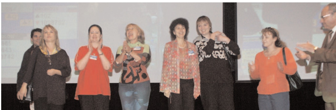
Happy winners: Russia celebrates a Gold Medal in the World Bridge Olympiad

A tough, aggressive team of unheralded players from Russia are the gold medallists in the Women's series of the World Bridge Olympiad, fending off a final-set rally by an experienced team from the USA. The final score was 271-259.