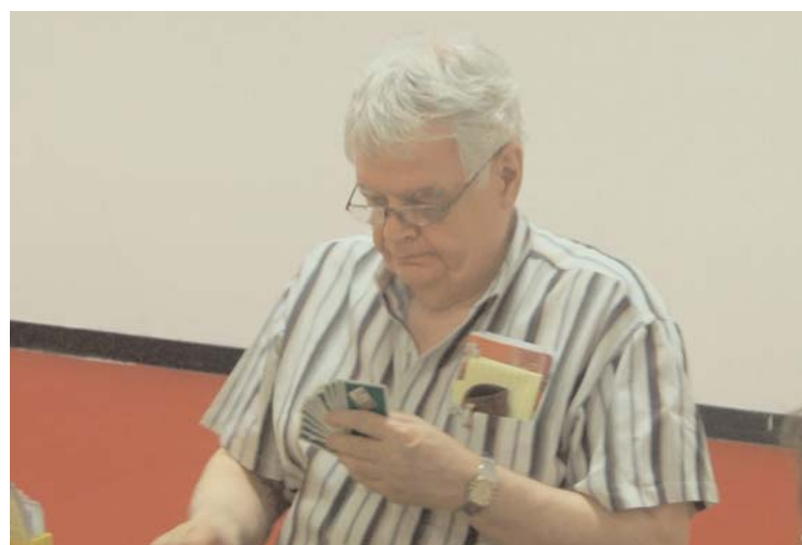
Bob Hamman, USA