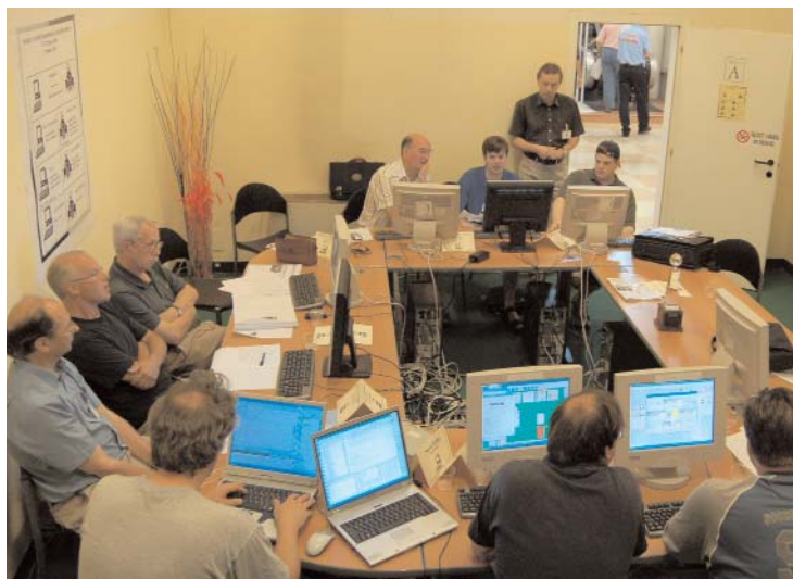
Competitors in the 10th World Computer-Bridge Championship

As the knockouts come down to the final stages and the pairs get into high gear, players at the 8th World Bridge Championships are experiencing their own versions of outrageous fortune.