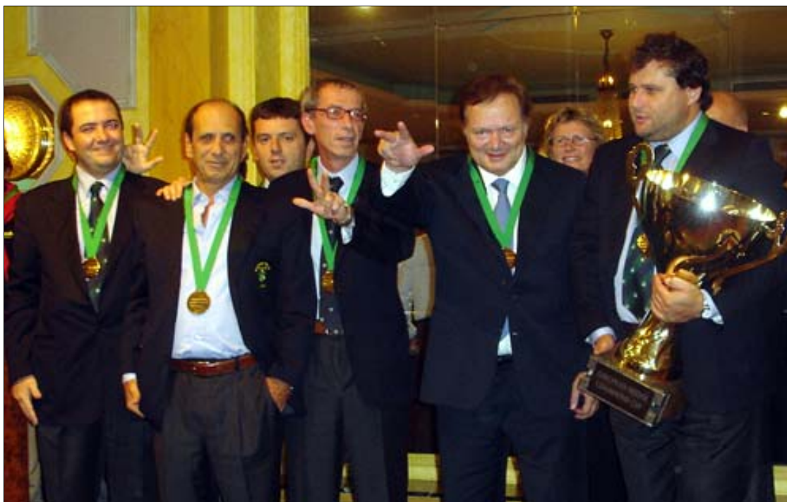
TC Parioli Angelini - Roma winner of the 2005 European Champions Cup

GSD Allegra - Italy - Sakura Krakow - Pol Fnc - France - Vestfold - Norway EYKT - Iceland - Bamberg BC - Ger