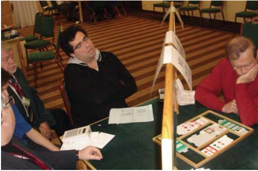
The Final – Parioli v. Sygnity