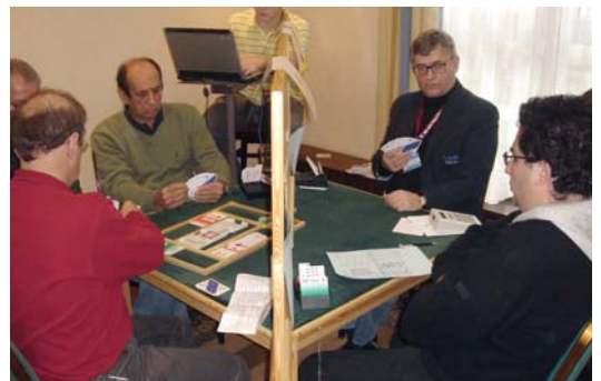
The Final – Parioli v. Sygnity