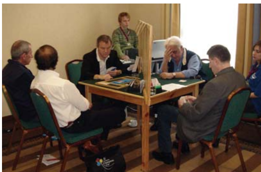
Semifinal – Parioli v. Bamberg

On the next board, we finally got our first slam swing of the session when a more con-