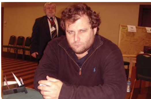
The Final – Parioli v. Sygnity – Fulvio Fantoni