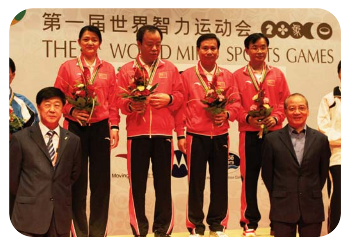
China, Men's Teams, Xiangqi