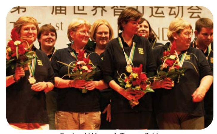
England, Women's Teams, Bridge