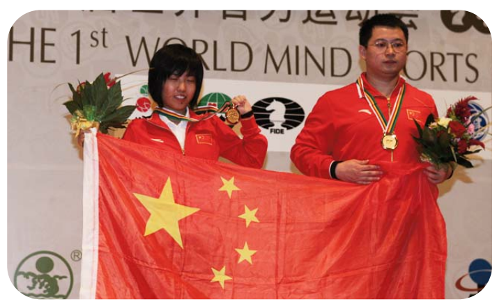
China, Mixed Teams, Go