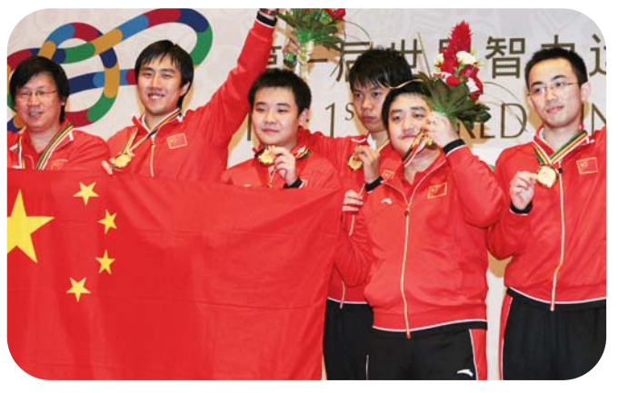
China, Rapid Men, Chess