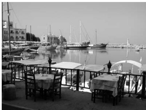
The harbour at Girne, Cyprus.

How did you fare with the lead problem? It comes from the International team tournament in Northern Cyprus, which was won by Hungary who defeated Bulgaria in the final.