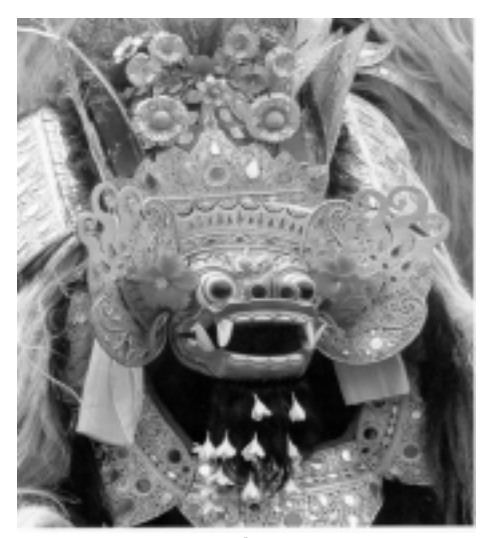
Enter the Dragon!

Bali is an enchanting island, with wonderful scenery and is of course, famous for its dance, carving and music. It is known as the "Island of the Gods". The Balinese believe that the Gods always spread their wings of affection to assure peacefulness to anyone who stays or visit there.