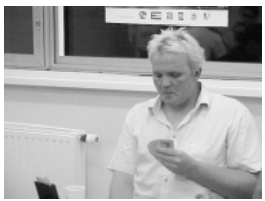
Going for Gold

On the next deal the Austrians were faced with another awkward decision at a high level.