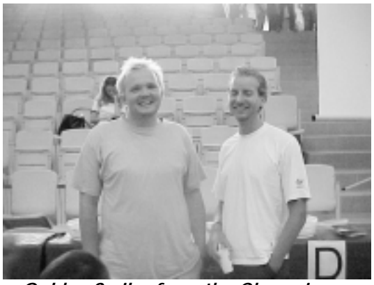
Golden Smiles from the Champions

Please don't be late for your transfer to the Airport in the morning. The buses have to leave on time!