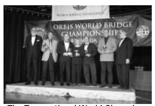
The Transnational World Champions

Balicki's Precision style two clubs was no thing of beauty, but it worked like a charm as West discovered his partner was minimum with no four-card major but saw things through to reach a game that proved easy to make after a low heart lead. +620 was worth 14 IMPs.