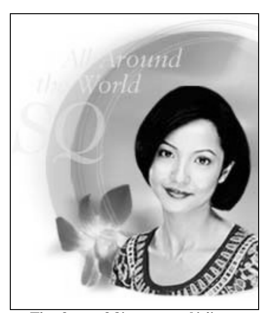
The face of Singapore Airlines

Contact you local SIA office and quote the World Bridge Championships.